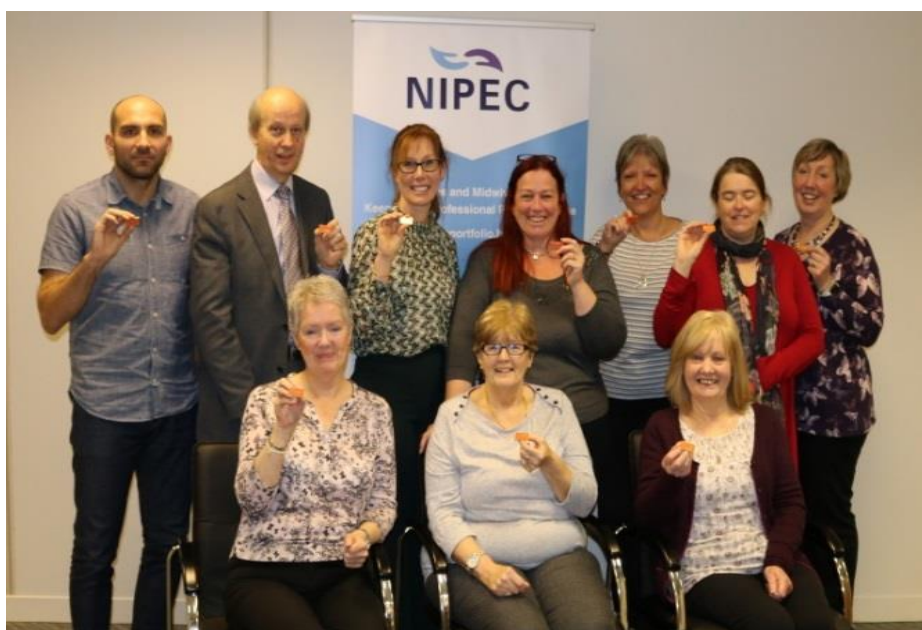
Photo: NIPEC staff awarded Level 1 Quality 2020 Attributes Framework badges

NIPEC co-led the development of the Quality 2020 Attributes Framework (DoH 2014) which supports the implementation of the Quality 2020 Strategy. NIPEC continues to promote the implementation of the Attributes Framework and associated learning and development programmes. We are very proud to have over-achieved on the regional target of thirty percent of staff trained in Level 1 Q2020 Attributes Framework by 31 March 2018; all NIPEC staff, professional and corporate administrative and information officers have completed their Attributes Framework Level 1 training.