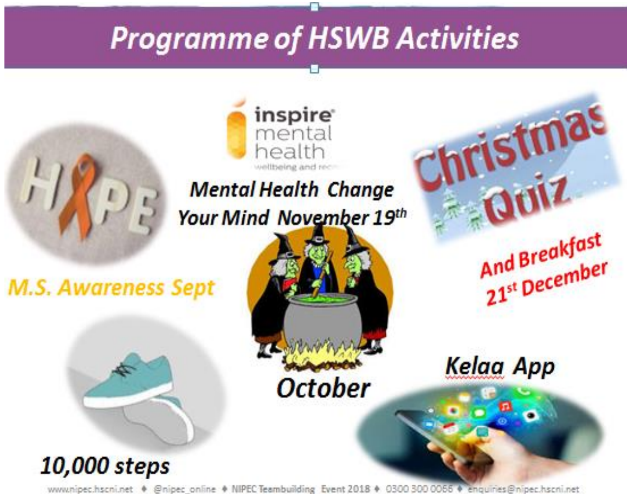
Figure 3: Programme of Health and Social Wellbeing Activities 2018-2019

The Health and Social Wellbeing Committee is made up of staff from across the organisation and they plan health and social wellbeing activities throughout the year, which are open to all staff to attend, if they wish. Some of the activities during 2018-19 are presented in Figure 3. In addition, through the auspices of the Committee, NIPEC staff nominates a local charity, on an annual basis, raising much needed funds which is then donated to the charity.