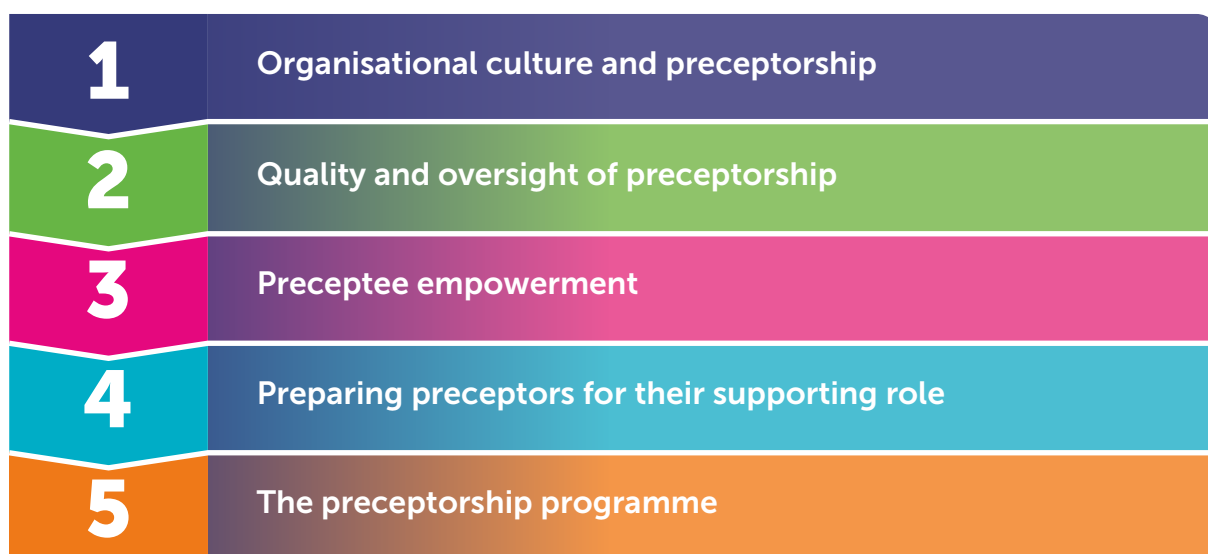
Figure 2: NMC Principles for Preceptorship (1)