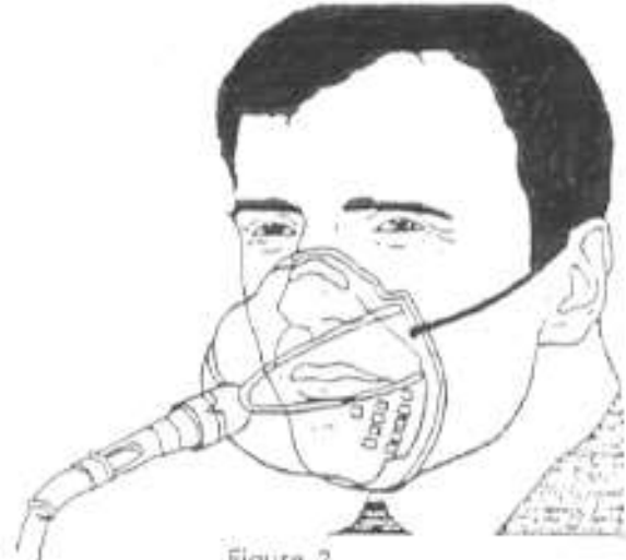
Figure 2 Ventimask Mk1V, 28%