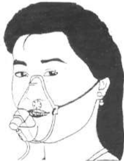
Figure 4 Venticare Mask