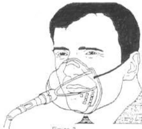
Figure 2 Ventimask Mk1V, 28%