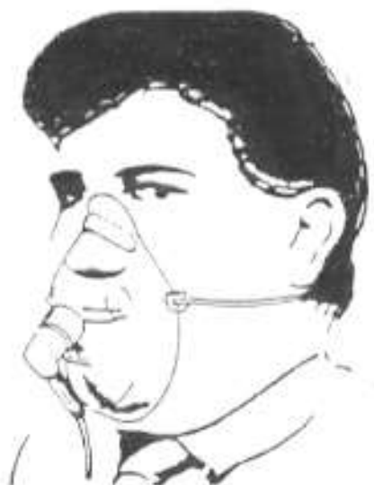
Figure 3 Inter-Surgical Q05 Mask