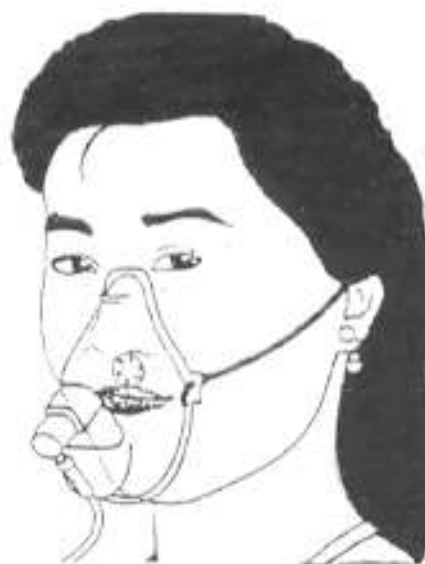
Figure 4 Venticare Mask