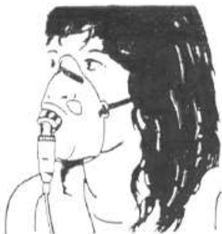
Figure 1 Inter-Surgical Q10 Mask