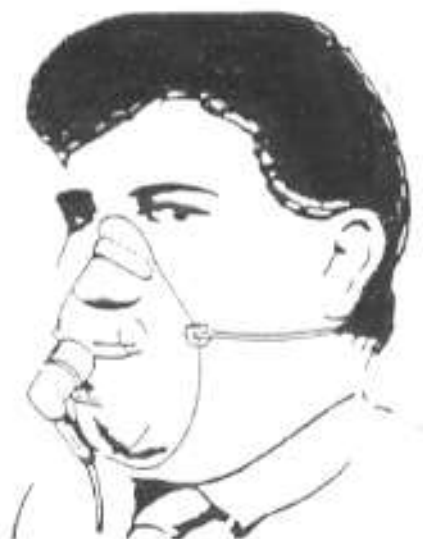
Figure 3 Inter-Surgical Q05 Mask