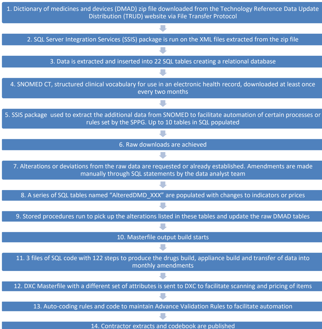
Figure 3: Monthly process for producing an updated Northern Ireland Drug Tariff Masterfile

The steps outlined above provide a robust and accurate Drug Tariff Masterfile on a monthly basis. However, the process is entirely dependent on the expertise of the Data Analyst team within BSO. It is recognised that the reliance on specific individuals carries a risk in terms of potential quality issues. For example, if a member of the data analyst team becomes unavailable this could cause major issues in relation to the running of the monthly automation process, and subsequently to the payment run. Although a secondary concern, this would also have the potential to impact on the statistical reporting process.